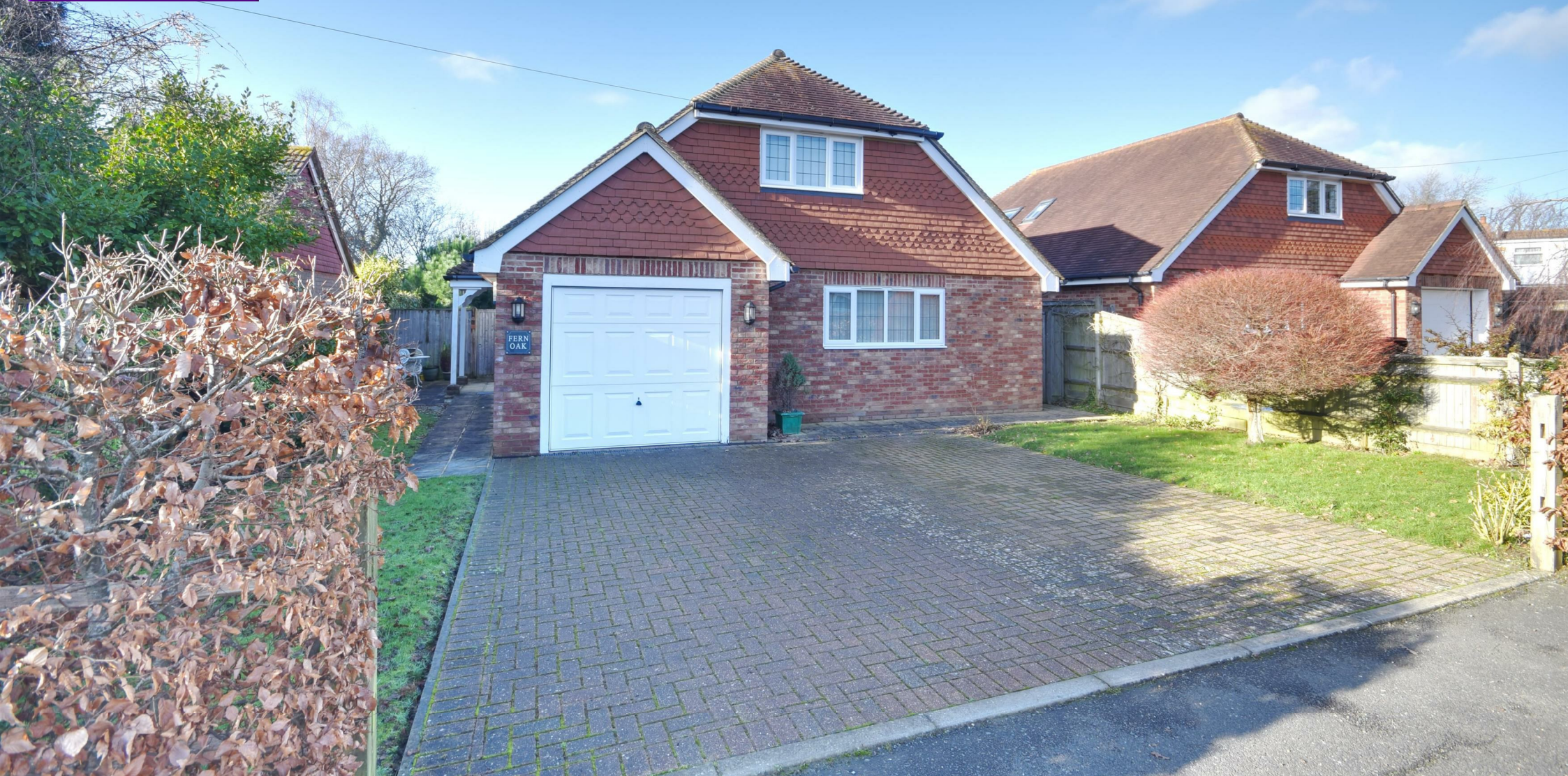
Fern Oak, St. Marys Close, Brede, East Sussex, TN31 6HD. £575,000 Guide Price.