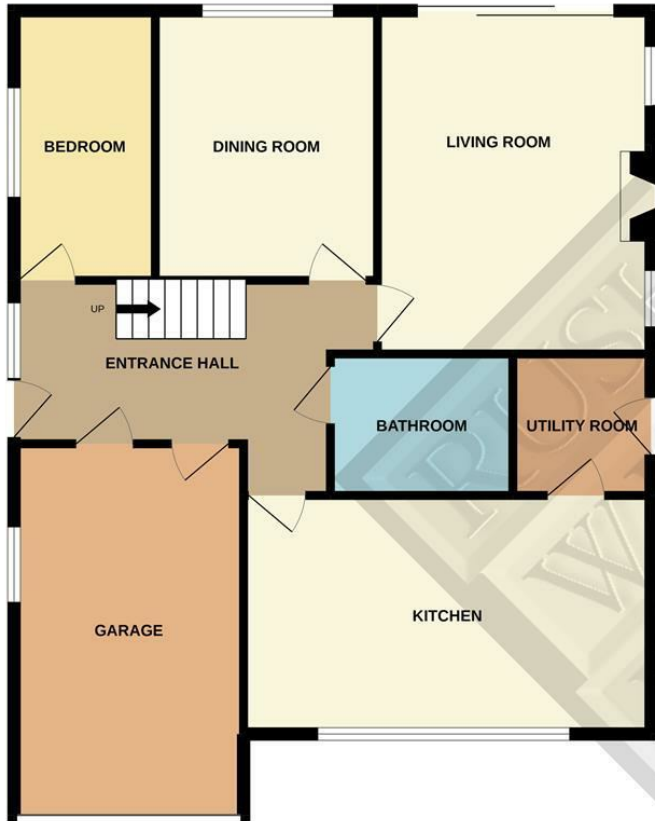
GROUND FLOOR 926 sq.ft. (86.0 sq.m.) approx.